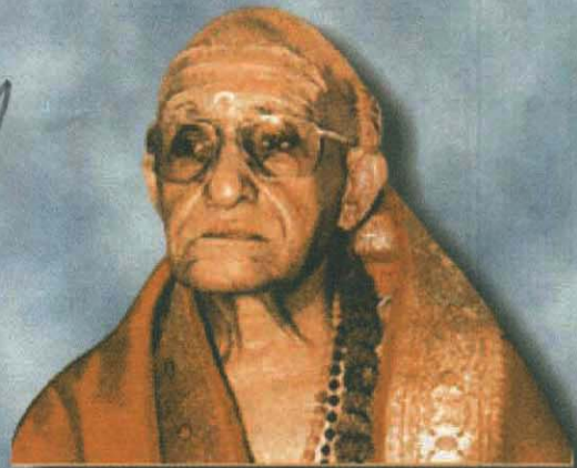
Grand Old Man of Karnatak Music Dr. Semmangudi R. Srinivasa Iyer